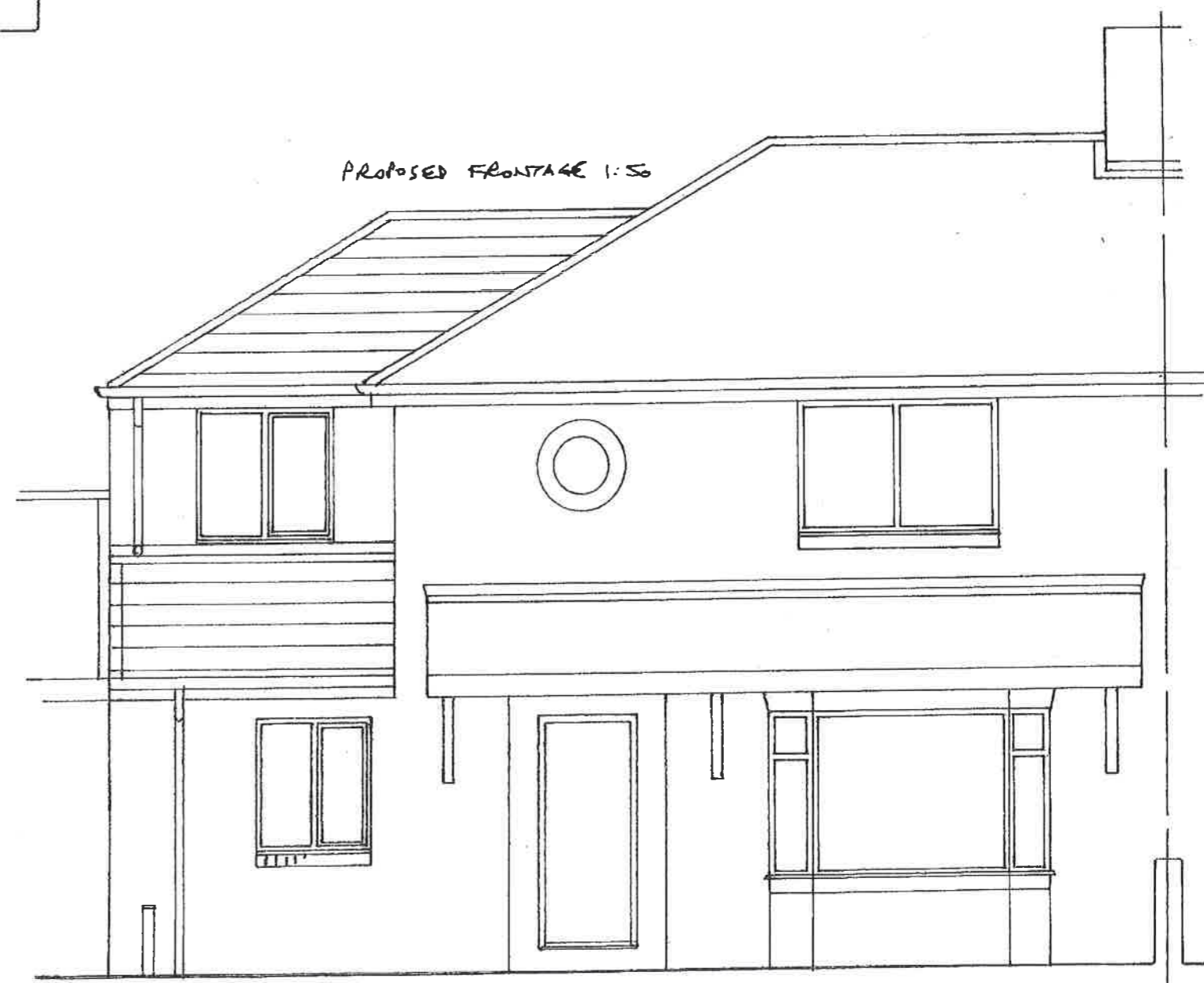
PROPOSED FRONTAGE 1:50

PROPOSED EXTENSION TO 16 BIRCH AVE., WHITBURN FOR MR. WHITE DRG NO 1